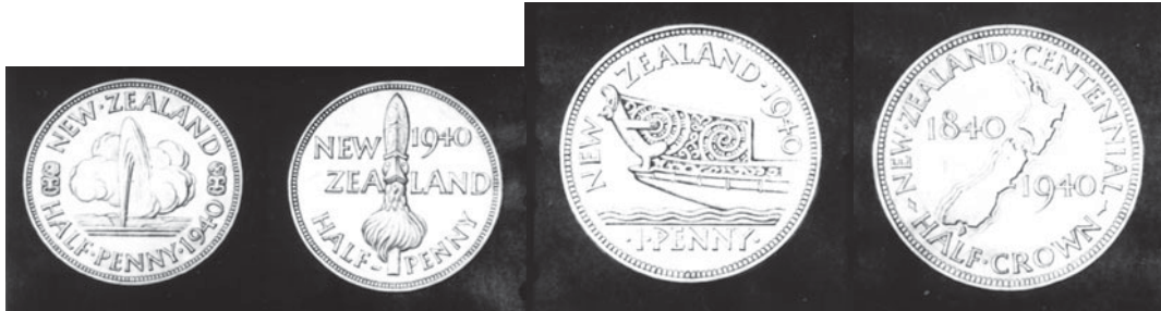
Figs. 12–15. Kruger Gray, two designs for 1940 halfpenny, design for 1940 penny and for 1940 half-crown.