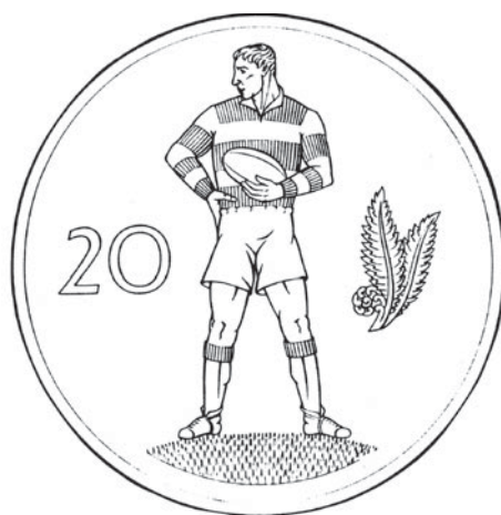
Fig. 8 Francis Shurrock, Design for 20 cents reverse, 1965.

The handshake motif provides an interesting variant on the Waitangi Crown, a surprising choice on Shurrock's part given the poor reception accorded to that coin. Equally remarkable is the penny design depicting a rugby player, with a large fern leaf motif pressed awkwardly against him. A near-identical figure would be replicated by Shurrock some twenty-six years later in his design for the 20 cent decimal reverse (Fig. 8). This design caused a public outcry when it was leaked to the press on the eve of its intended announcement in February 1966. A further design by Shurrock for the penny, depicting a full-length Maori tekoteko (human-like) figure, would again be recycled, not once but twice, for his 1949 Margaret Condliffe Memorial Award medal, as well as for another of the leaked decimal designs, the proposed 10 cent reverse. 39