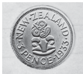
Fig. 20. Kruger Gray, Model for proposed 1933 threepence.