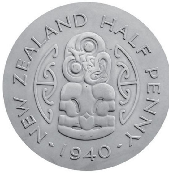
Fig. 28. Metcalfe after Mitchell, plaster model for halfpenny, 225 mm, Royal Mint Museum, Llantrisant.

Perry sent Metcalfe an electrotype made from the revised matrix of the half-crown, telling him that it had proved considerably easier to make the requested pattern modifications on the skirt using this in preference to the punch, from which the engraver can remove detail but not normally add anything new. He told Metcalfe: 'I have shown this impression to Mr Craig, and we all feel that the pattern has been done well and will probably be acceptable to the High Commissioner'. 81 After Metcalfe had cabled back confirmation that the pattern was excellent,