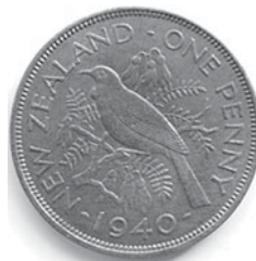
Fig. 2. New Zealand, 1940 penny, reverse (Mitchell).