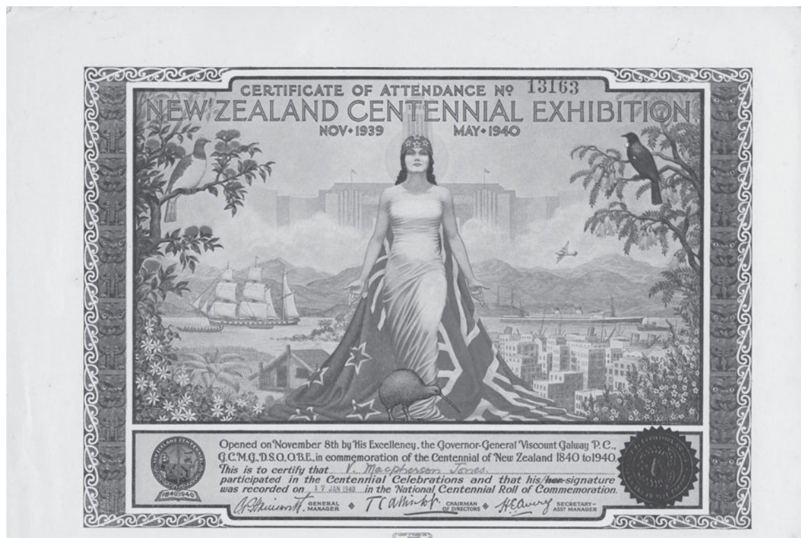
Fig. 29. Mitchell, Certificate of Attendance, 1940 New Zealand Centennial Exhibition (© Hocken Collections Uare Taoka o Hakena, University of Otago, MS-3044/009).

The 1940 celebrations, at their height when the coin was issued, reflected much the same