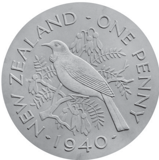
Fig. 27. Metcalfe after Mitchell, plaster model for penny, 220 mm, Royal Mint Museum, Llantrisant.