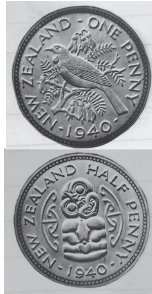
Fig. 22. Metcalfe after Mitchell, 1940 penny and halfpenny. National Archives PRO MINT 7/43.

Mitchell – about the matter. 60 However, the New Zealand government order for 72,000 pieces that had been made four weeks previously was ‘urgent’, and this surely forestalled any last-minute changes. 61 Probably these were in any case aesthetically unnecessary, as the scroll-like patterning around the hei-tiki – a simplified form of kowhaiwhai (rafter pattern) of the man-gopare (hammerhead shark) design of no specific regional or tribal affiliation – successfully complements it, echoing the shape of the coin. 62 The design is neat, simple and direct, an effective and appropriate one for a coin of this denomination and scale. A hei-tiki minus the kowhaiwhai , as seen in Kruger Gray’s earlier trial, certainly suited a threepence but might have appeared somewhat stark on the larger halfpenny coin. The hei-tiki itself represents a marked refinement on Kruger Gray’s precedent, which has an uncomfortable head/body proportion. It probably reflects Mitchell’s greater familiarity with the motif as a Pakeha (European) New Zealander, although Elliott took some personal credit for improving it. 63 The figure is a very generic one, representing the common format with both hands placed on its thighs, as distinct from the rarer, older and probably less numismatically satisfactory type, with one hand to the mouth or chest, and the other to the thigh.