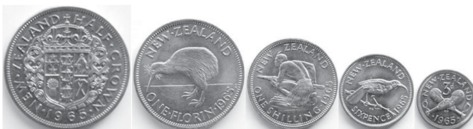
Fig. 4 a–e. New Zealand, 1933–4 reverses (George Kruger Gray).