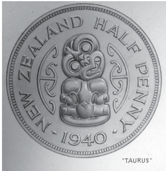
Fig. 21. Mitchell, Drawing for 1940 halfpenny, 118 mm. PRO MINT 24/289.