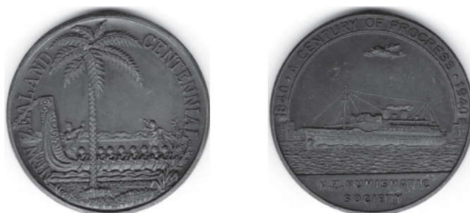
Fig. 5. New Zealand Numismatic Society, 1940 New Zealand Centennial Medal, bronze, 38 mm. Obverse: Thomas Hugh Jenkin; Reverse: James Berry.

favoured the half-crown as the highest denomination and therefore the most appropriate one to function as a special coin. 30