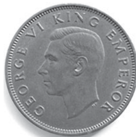
Fig. 1. New Zealand, 1940 half-crown, obverse; Leonard Cornwall Mitchell, reverse.