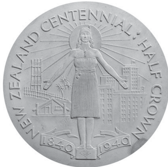
Fig. 26. Metcalfe after Mitchell, plaster model for half-crown, 225 mm, Royal Mint Museum, Llantrisant.