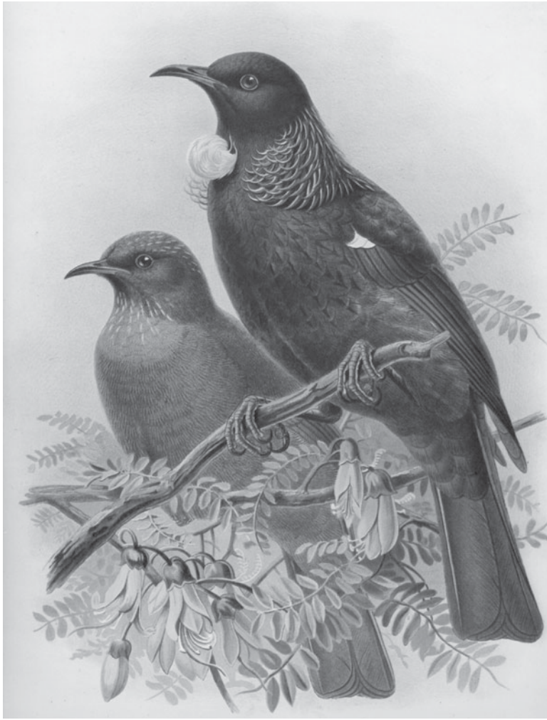
Fig. 24. J.G. Keulemans, Tui , in Walter Buller, A History of the Birds of New Zealand (London, 1888), pl. X.

the form of a plaster model ... Moreover there is likely to be some difficulty in the artist modeller interpreting in plaster another artist's design. 69