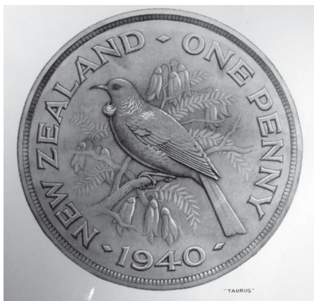
Fig. 23. Mitchell, Drawing for 1940 penny, 142 mm. National Archives PRO MINT 24/289 .

this denomination, but it also fitted the permutation of designs. Native birds featured on the proposed penny, the sixpence and the florin. These would alternate with Maori-related designs on the proposed halfpenny, the threepence, the shilling and, in its framing ornament, the standard half-crown. The original source of Mitchell's tui was almost certainly the illustration by J.G. Keulemans to the second edition of Walter Buller's classic A History of the Birds of New Zealand (1888), where a pair of them, a juvenile and adult, are depicted perching on a kowhai branch (Fig. 24). 64 The attitude of the adult is close to Mitchell's design. But a more immediate – and likely – source was The 'Three Castles' Book of New Zealand Birds (1930), whose illustrations were crude derivatives of Keulemans. 65 Sponsored by the tobacco manufacturers W.D. and H.O. Wills, this popular and low-priced pair of volumes was published by Coulls, Somerville and Wilkie. Coincidentally, Mitchell was successively employed as an artist by both of these companies during the 1930s and 1940s. 66