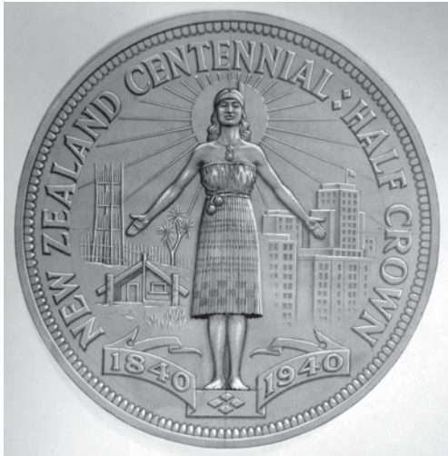
Fig. 25. Mitchell, Drawing for 1940 half-crown, 142 mm. National Archives PRO MINT 24/289.