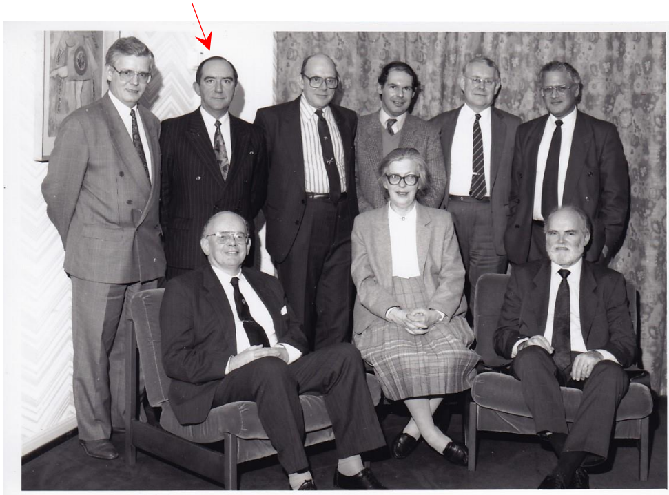
Leeds University History Department c. 1980.