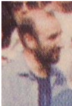
Coin News - 1991-Nov-14