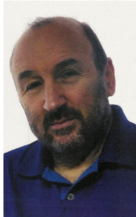
Coin News 2007 p60