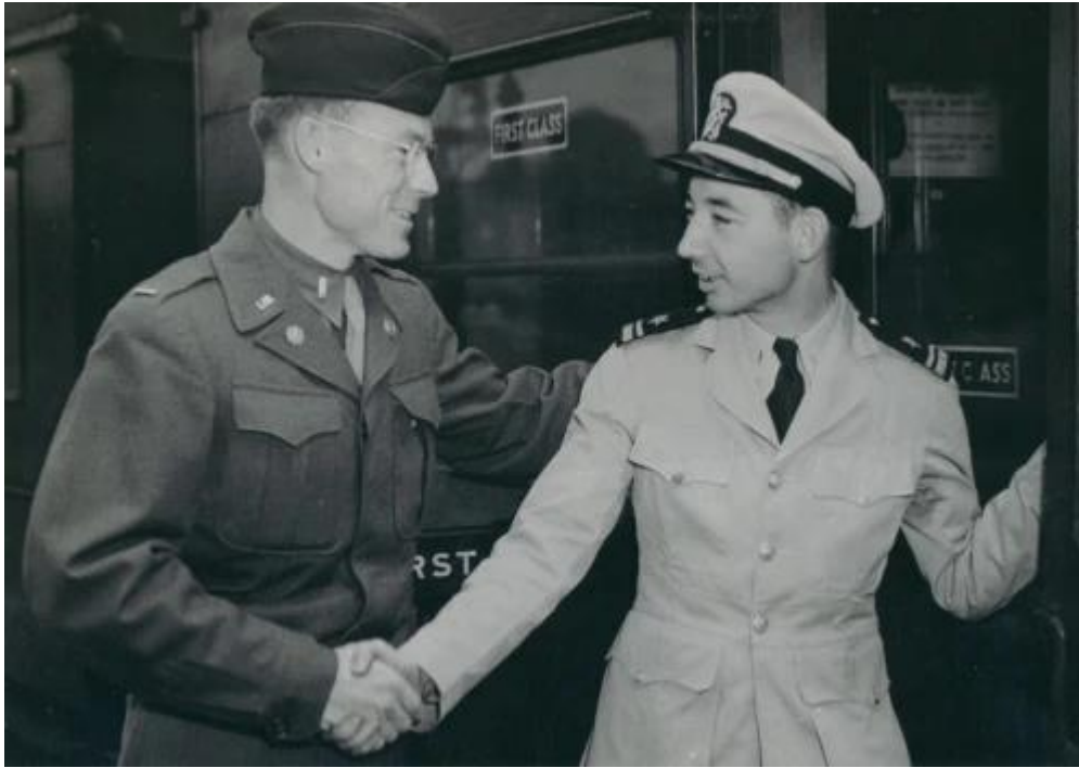
On the left - Photo thanks to University of Southampton Special Collections (MS 379/3 A4024/10 )