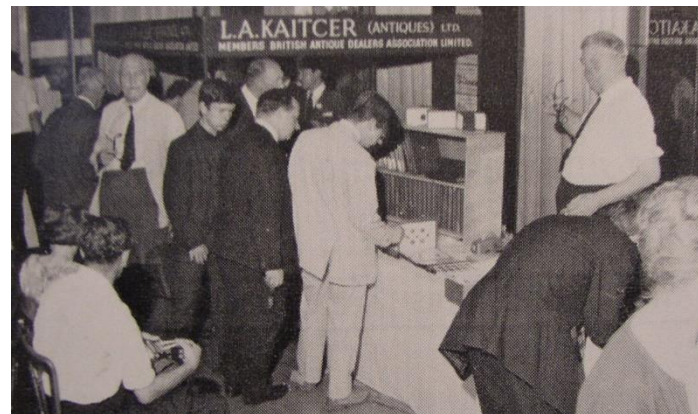
Coin News - 1968-Nov-909