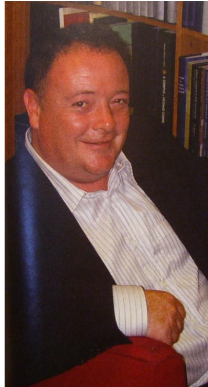
Coin News - 2006-Dec-47