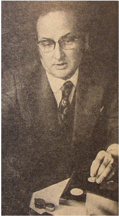
Coin News - 1977-July-36