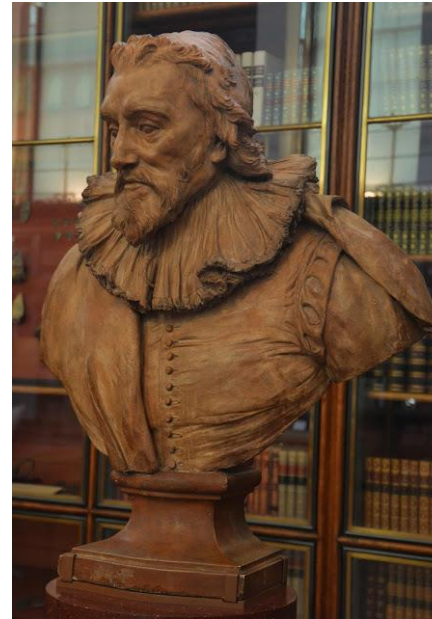
Bust of Sir Robert Cotton in the Wren Library Trinity College Cambridge