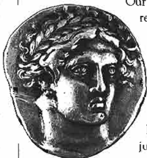
Macedon, Amphipolis Tetradrachm. Sold for £27,000.

Our commission rates are reasonable and open to negotiation on items of high value. Lots are usually offered for sale within 12 weeks of delivery, and vendors receive speedy settlement. For a free auction valuation just phone Adam Croton.