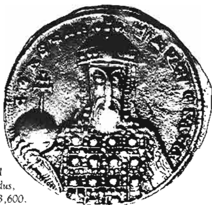
Constantine VII (913-959) Solidus, 945. Sold for £3,600.

Above: William III (1694-1702) Five Guineas "Fine Work type", 1701. Sold for £4,200. Below: Charles II (1660-1685) Pattern "Reddite" Crown, 1663. Sold for £8,800.