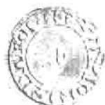
Aethelred II (978-1016)