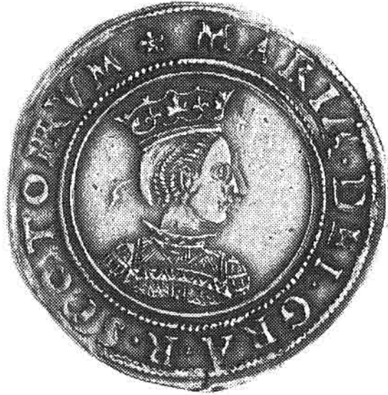
Mary Queen of Scots, Portrait Testoon, 1553. Sold 20th June 1990 for £8,580.