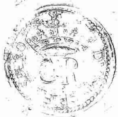
Wulfred Archbishop of Canterbury (805-832) Penny, Group 1, cross crosslet type, extremely fine, extremely rare Sold on 28 February 1989 at Christie's London for £7,150