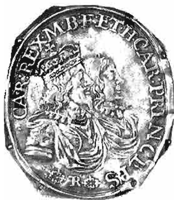
A didhe portrait of Charles I and Charles, Prince of Wales, by Thomas Rawlins, struck at the Oxford Mint in 1643, and recorded in a contemporary proclamation Sold in March 1989 for £750 to The National Museum of Wales.

Total Trade published in the Year 1989 of 100,000 copies, and 100,000 copies of 100,000 copies, and 100,000 copies