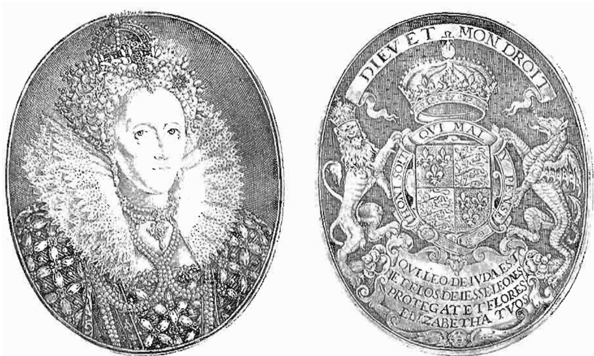
Elizabeth I, oval silver plaque by Simon de Passe, after a miniature by Isaac Oliver, sold in February 1987 for £8,800.

Annual subscription to our coin catalogues is £15.