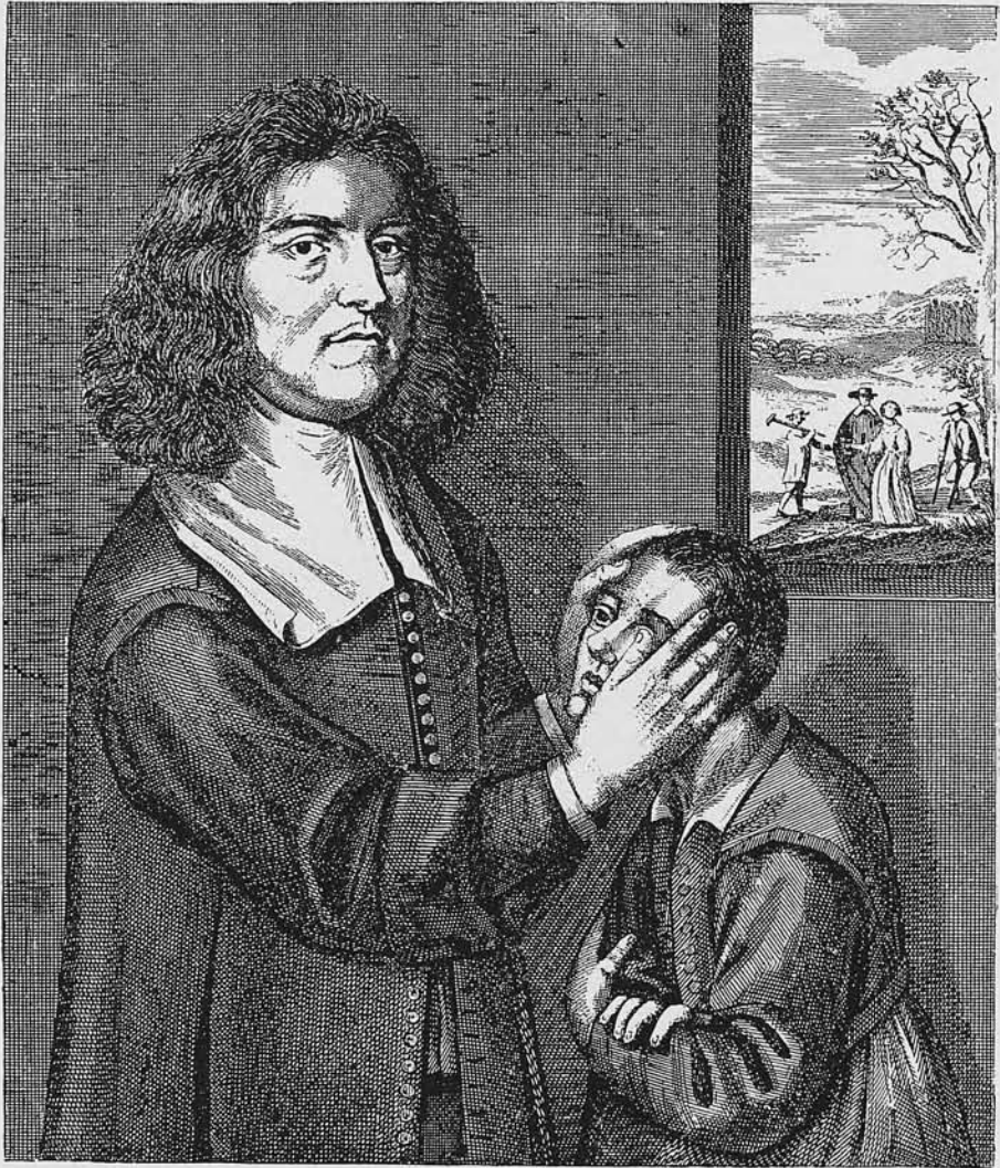
The true and lively Pourtraicture of Valentine Greatrakes Esq of Affane in y e Countie of Waterford in y e Kingdome of Ireland famous for curing several Diseases and distempers by the stroak of his Hand only. ~