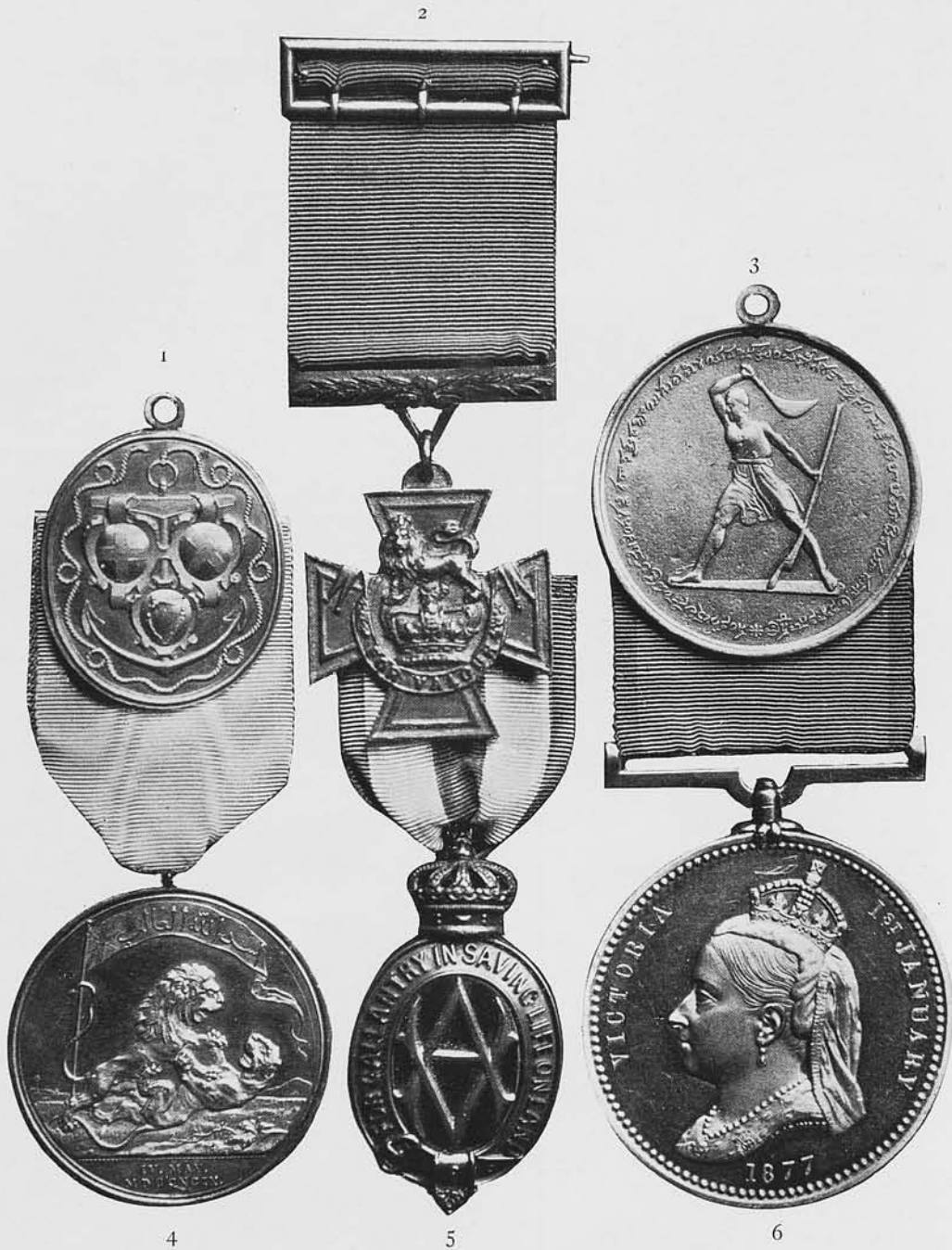
SOME INTERESTING BRITISH MEDALS.