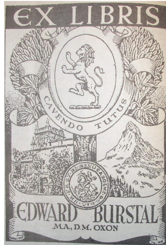
Coin News - 1982-Mar-46