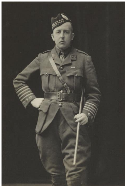
c.1916. Ax46111