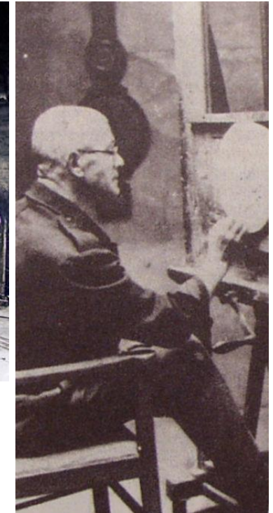
Coin News -2012-Apr-32