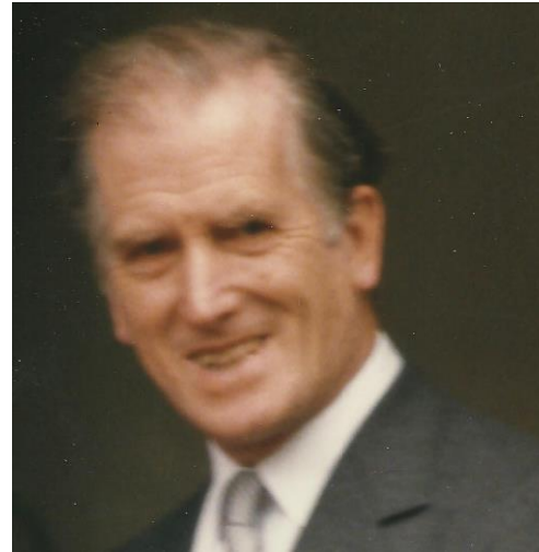
Thanks to the University of Leeds