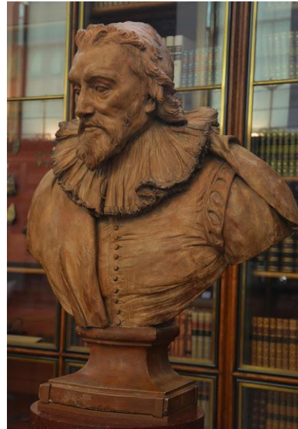
Bust of Sir Robert Cotton in the Wren Library Trinity College Cambridge