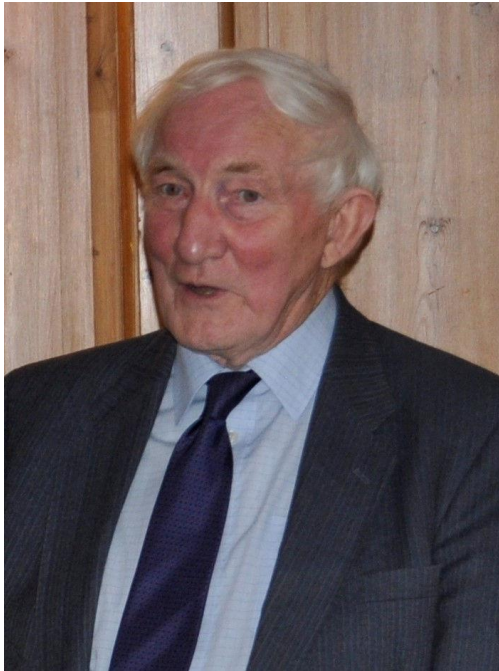
At the 2012 book launch