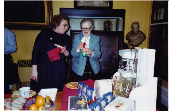
Leaving Leeds 1991