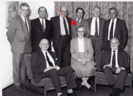
At the Leeds History Department c.1980