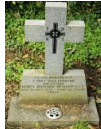
Grave at St Mary Church, Marshchapel, Lincs