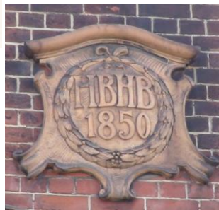
Plaque on Beaufoy Institute, London