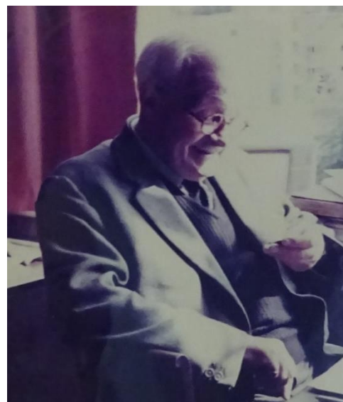
At home in Richmond