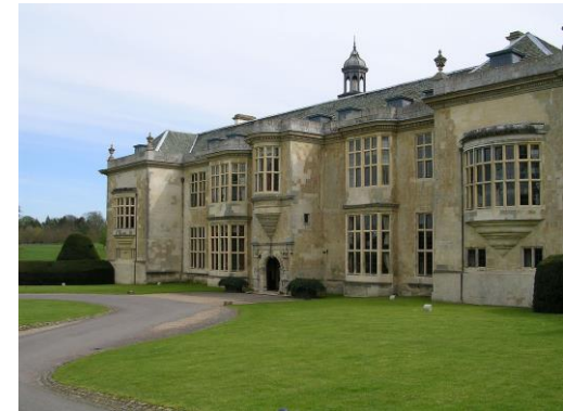
Hartwell House, Buckinghamshire