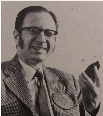
Coin News - 1971-Feb-24