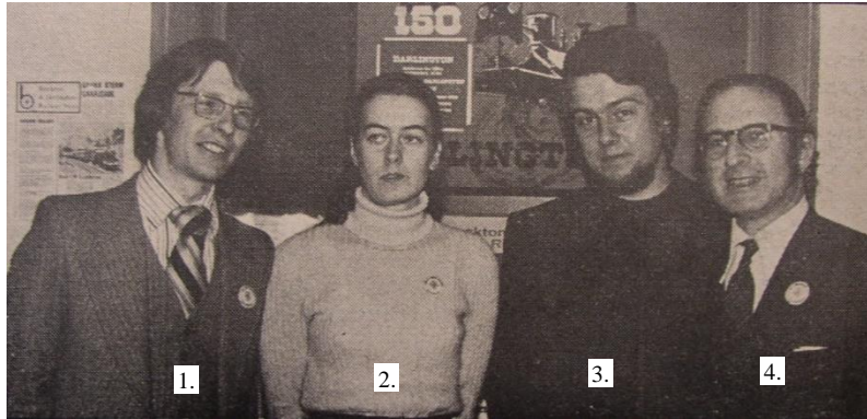
Coin News - 1975-Sep-19