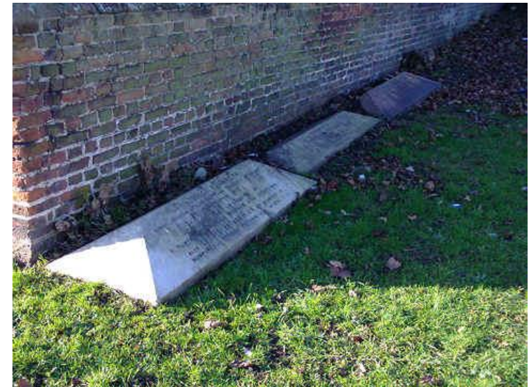
Gravestone in Strood-St-Nicholas