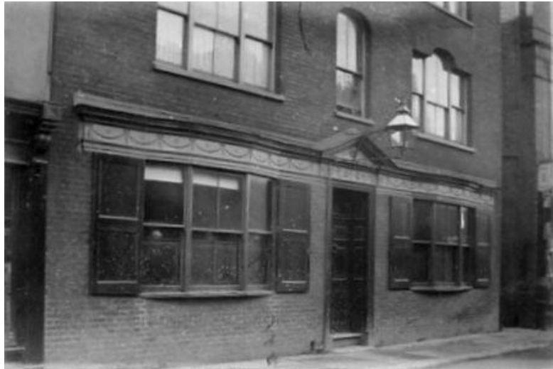
HW's office and home